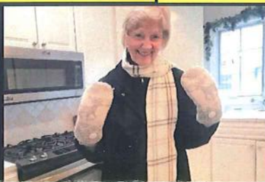
Service & Other Activities