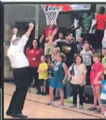
Fundraiser – Paper Recycling