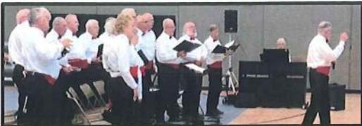
Service – Golden K Singers