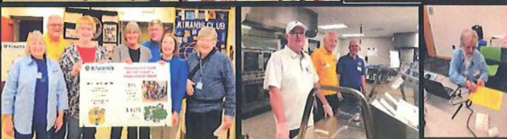
For more information, www.amesgoldenk.org

GK members donated $33,135 to the Ames Foundation for the All-Inclusive Playground and Miracle League Field. The project features a playground with 100% accessible equipment for children with physical, cognitive and sensory disabilities and a baseball diamond for competitive and noncompetitive athletic events for children and adults with disabilities and their families.